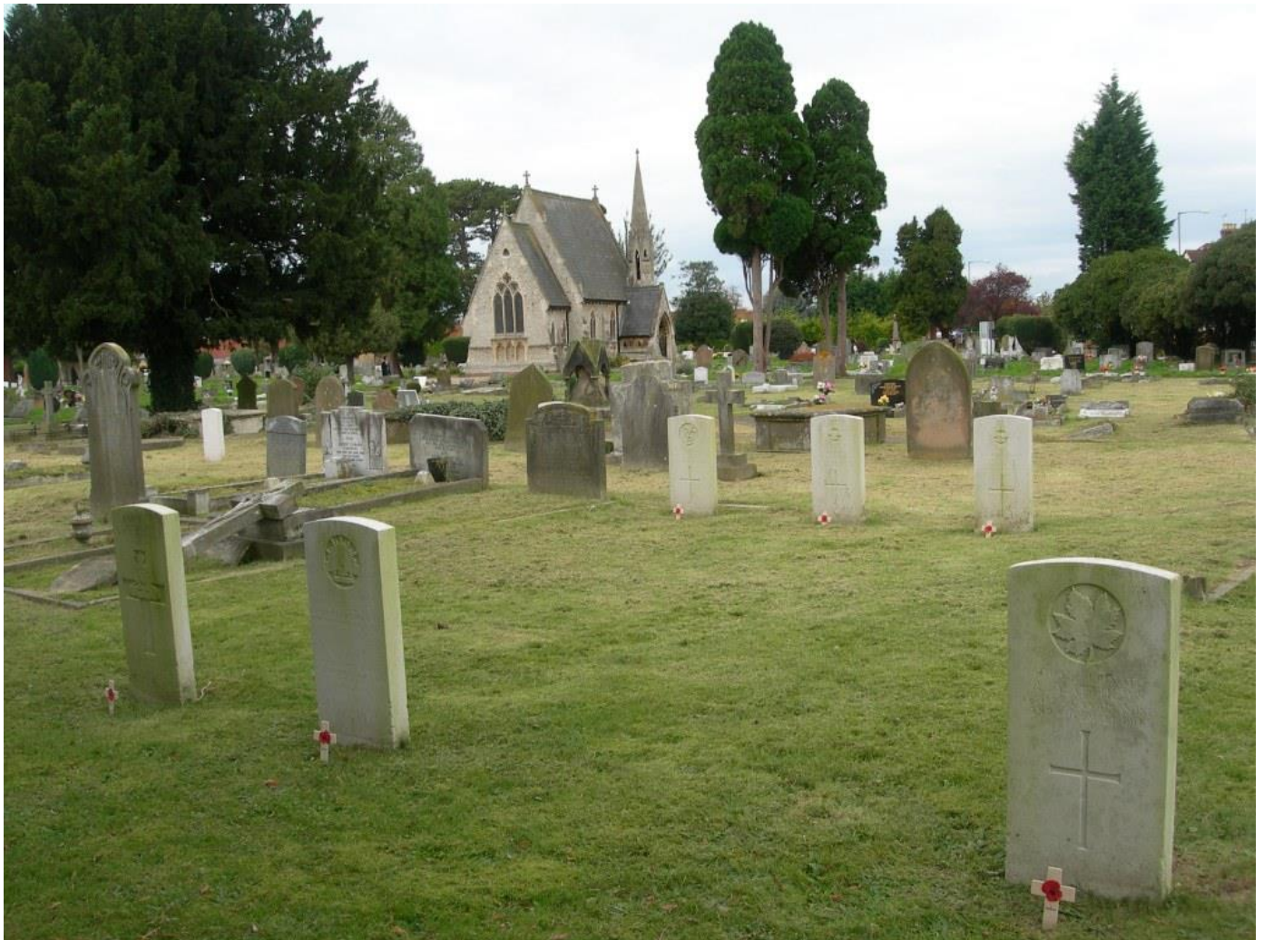
Tring Road, Cemetery, Aylesbury, Buckinghamshire

Tring Road, Cemetery, Aylesbury, Buckinghamshire contains 107 War Graves from both World Wars, 3 of these belong to Australian Air Mechanics 2 nd Class.