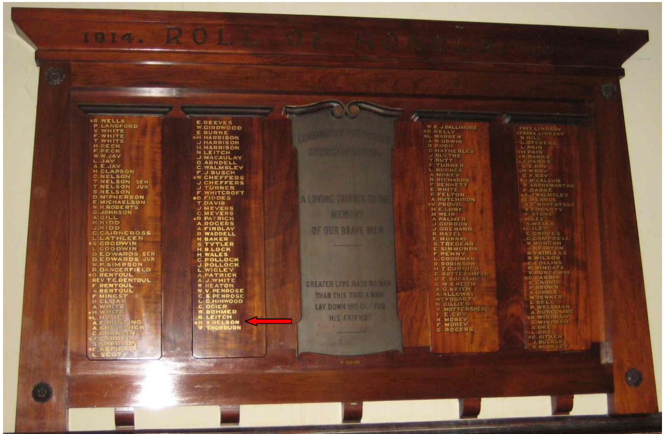
Kensington Methodist Church Roll of Honour